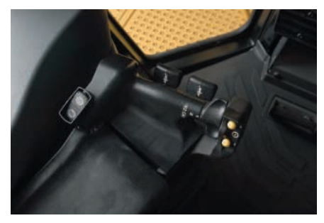
Finger Tip Controls (FTC). Clustered for easy, one-hand operation to the operator's left. They control steering, machine direction and gear selection.

Ripper Control Lever. A rigidly mounted handgrip provides firm support for the operator even when ripping in the roughest terrain. The low effort thumb lever controls raising and lowering. The finger lever controls shank-in and shank-out positioning. The thumb button automatically raises the ripper.