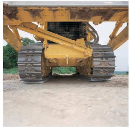
Tag-Link. The Tag-Link brings the blade closer to the machine for more precise dozing and load control.

Equalizer Bar. The equalizer bar features limited slip seals and an oil-lubricated joint for better oil flow. Remote lube passages simplify maintenance. Large forged pads reduce wear on the mainframe and extend sealed joint life.