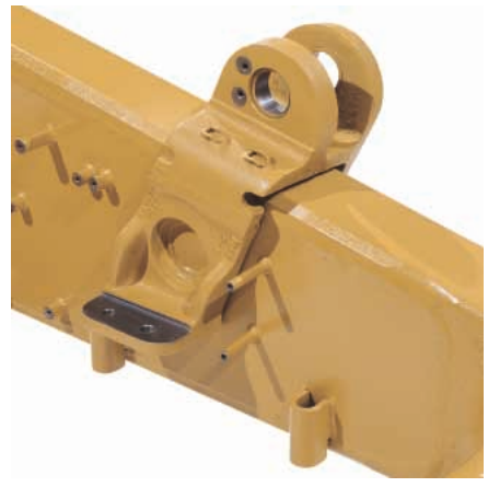
Engine and Radiator Guard Mount. The new fabricated common front engine and rear radiator mount feature heavy castings.

Mainframe Strength. The D10T mainframe is built to absorb high impact shock loads and twisting forces.